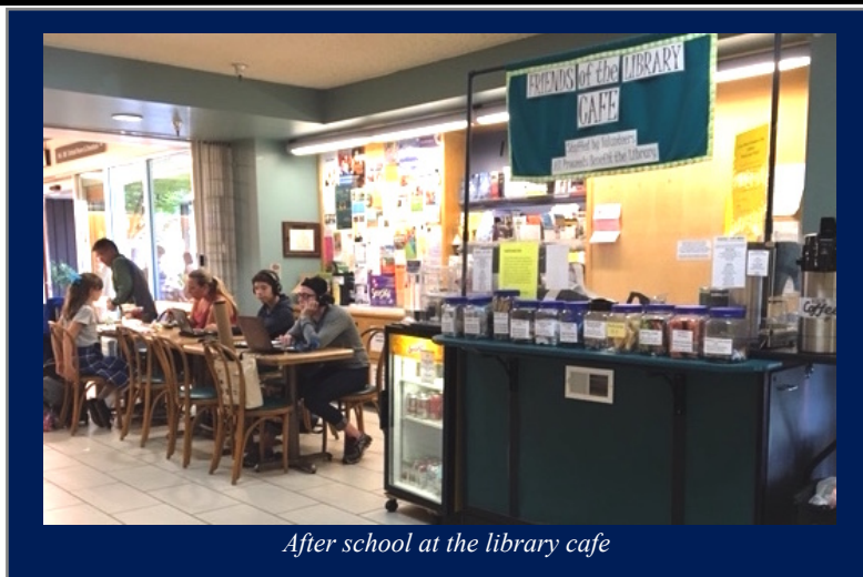
After school at the library cafe

Ordinarily we spend only a small portion of our income on administrative expenses (about 8%). However the Friends had a few additional expenses this year. We redesigned our web site, a one-time investment, and purchased several new devices for scanning books that improved our ability to spot valuable books. A direct result of that purchase can be seen in our increase in the on-line sales income. FOL showed our appreciation to Hillview Community Center with a gift of 8 new tables for the center's use, which is shown as a Community Support Project.