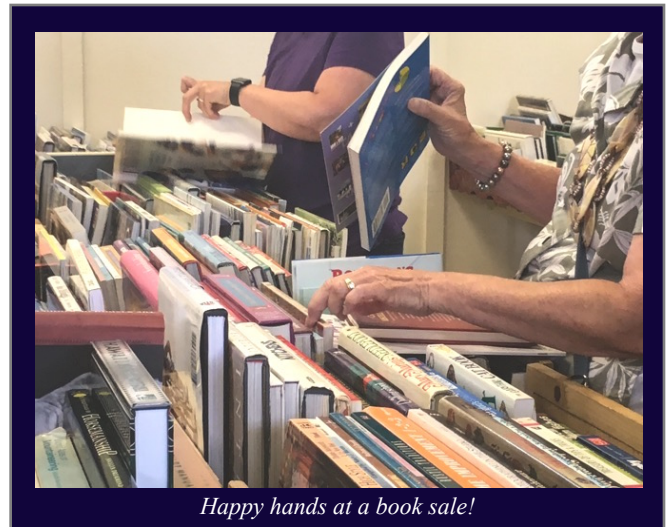
Happy hands at a book sale!

Total income for the year was $191,000. Our primary sources of income, our quarterly used book sales and the ongoing sales in the library, grew from $105,000 in 2015-16 to almost $112,000 this year. In addition, we have established a relationship with an auction house to handle very valuable books and were thrilled that a single book this year (written and autographed by Albert Einstein) brought in $7,500! Our used book sales on Amazon raised $18,000, a remarkable 37% increase. And finally, our cafe income increased from $11,000 to $13,500. Over all, our fundraising efforts earned over $150,000, an increase of over $10,000 from the previous year.